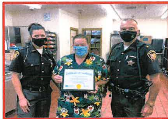
2021 Wood County Clean Plate Award presented to WC Justice Center

THE OHIO STATE UNIVERSITY COLLEGE of FOOD, AGRICULTURAL, and ENVIRONMENTAL SCIENCES